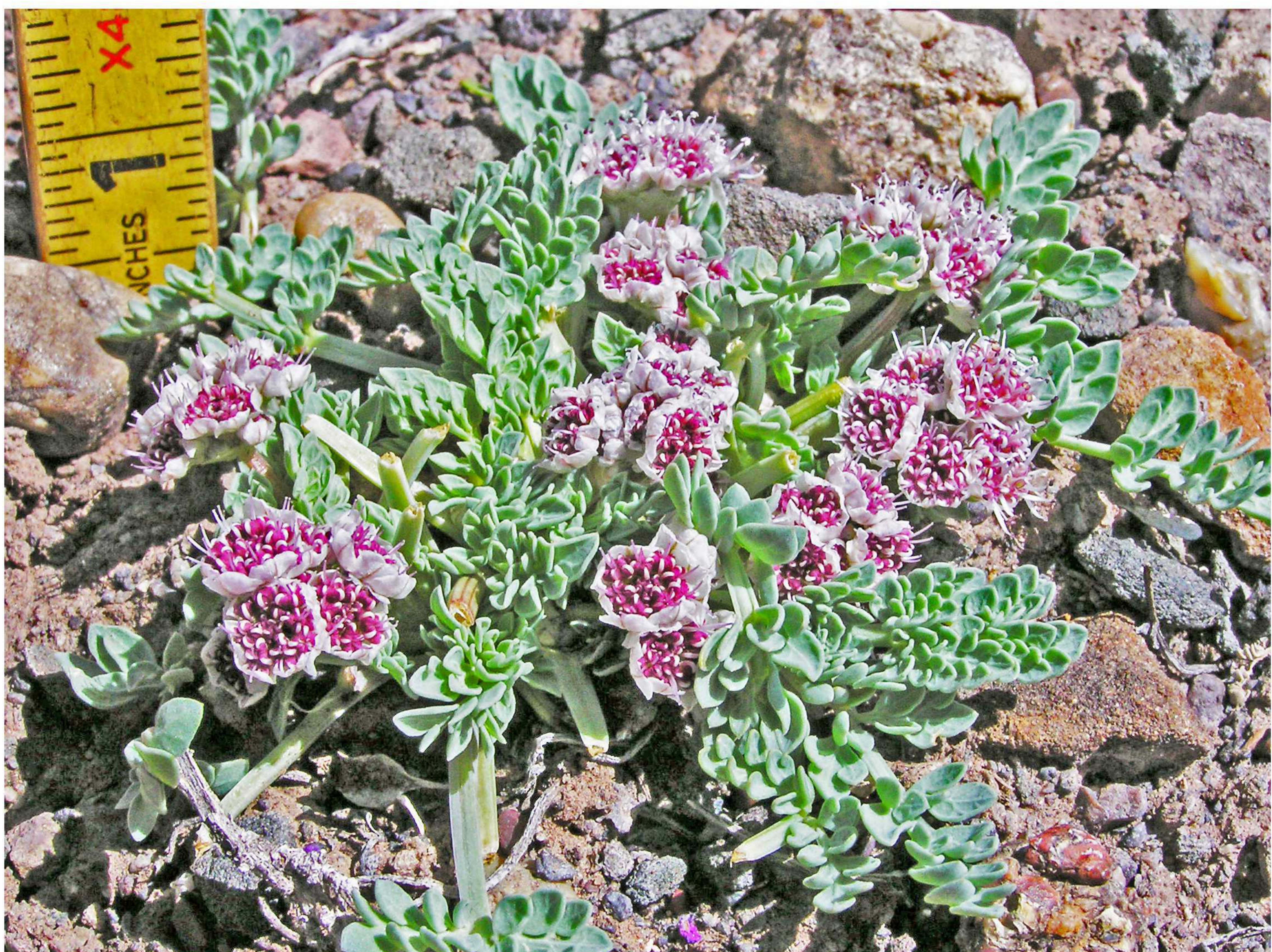
Figure 1. Vesper bulbosus from Montezuma Co., Colorado, 27 March 2005.

Distinct in its combination of thick taproots, acaulescent habit but consistent production of pseudoscapes, compact inflorescences, white to cream, pink, or purple petals, dorsally compressed mericarps with 4–5, thin, broad dorsal wings (3) and lateral wings (2) and with 3–9 oil tubes per interval, and particularly by its involucel bracts basally connate, prominently nerved, and totally white to purplish-scarious or with broad white-scarious margins. Outer umbellets of staminate flowers, inner ones of pistillate or staminate flowers in part; carpophore bifid to base or absent.